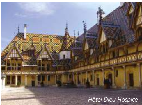
Hôtel Dieu Hospice