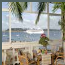
Hôtel Printania ***