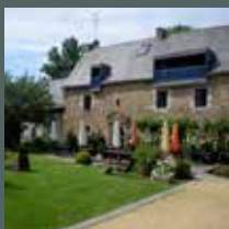
Le Manoir des Portes ***