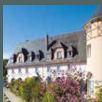
Hôtel de Diane ***