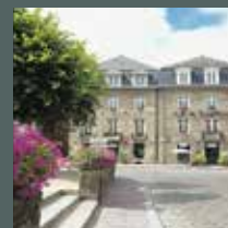
Hôtel Le d'Avaugour ****