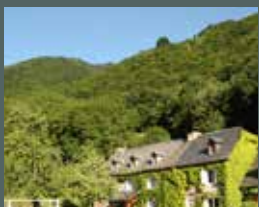
Domaine de Ramonjuan ★★★