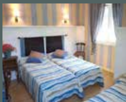
Hôtel Bon Repos ★★★