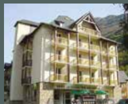
Hôtel Le Montaigu ★★★