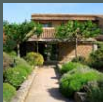
Mas de la Sénancole ***