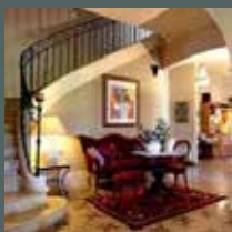
Hôtel l'Hermitage ***