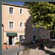
Hôtel Sainte Anne ***