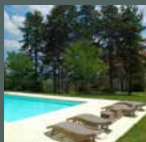
Hôtel Meysset ★★★