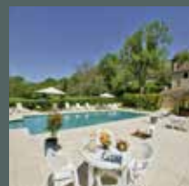
Le Moulin du Mitou ★★★