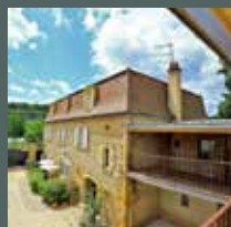
Hôtel Les Glycines ★★★★