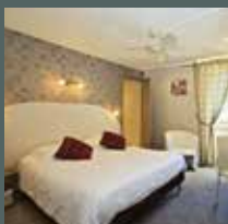
La Vieille Auberge ★★★