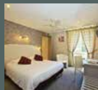
La Vieille Auberge ***