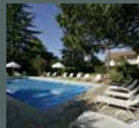
Le Relais Sainte-Anne ***