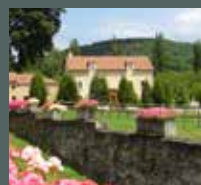
Château de Monrecour ***