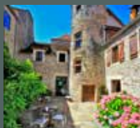
Hôtel La Terrasse ***