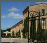
La Villa Romaine ****