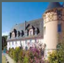
Hôtel de Diane ***