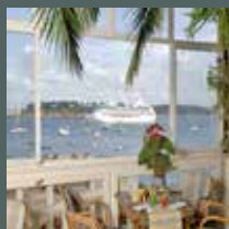
Hôtel Printania ***