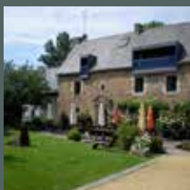
Le Manoir des Portes ***