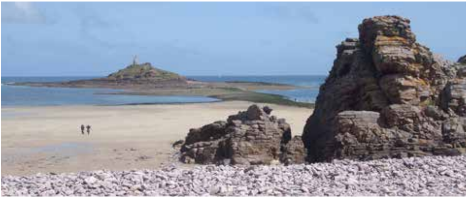
Îlot Saint-Michel, en route to Dinard