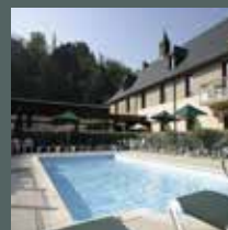
Hôtel Jerzual ****